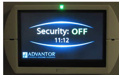
INFRATOUGH TOUCHSCREEN KEYPAD